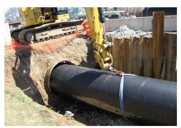
Different ways to inserting Weholite liner into the host pipe.

A pulling head can be secured to the leading end of the liner pipe to distribute the pulling load to the entire pipe wall circumference. To ensure that the liner pipe is in the correct grade and alignment, a staging area is established from which the pipe can be inserted.