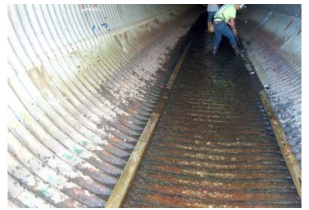
Wooden rails at the 5 and 7 o'clock position.