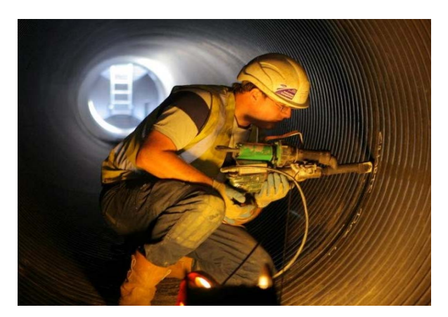
The inner wall (IW) weld.