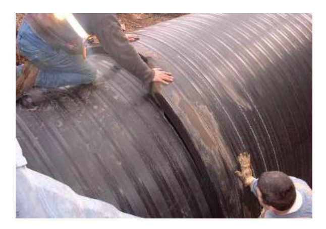
Profile Cut End.

Infra Pipe Solutions internal weld procedures have been developed to describe in detail how manually and semi-manually executed extrusion welds are to be made. Contact Infra Pipe Solutions for a copy of the current procedures.