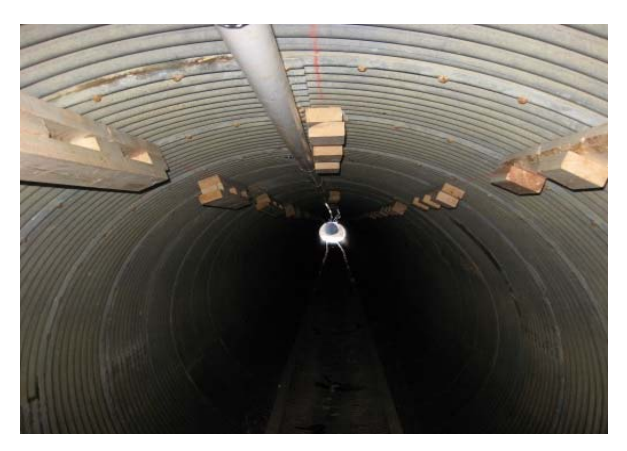
Wooden blocking at 10, 12 and 2 o'clock position.