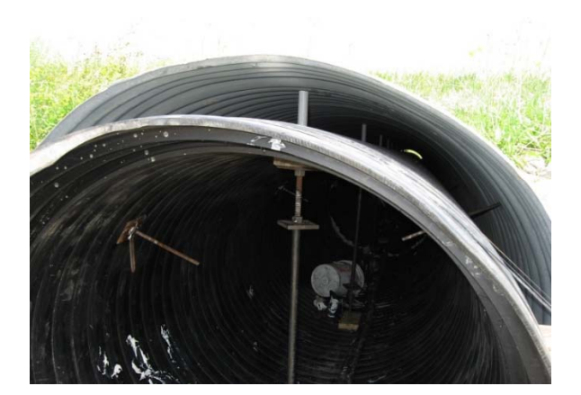
Using jacks to hold the pipe down.

The flotation force acting on a liner is proportional to the weight of the displaced grout. Flotation forces are much lower when using low density cellular grouts. Filling the liner pipe (partially or wholly) with water will counteract the buoyant force of the displaced grout. Grouting in lifts will also reduce this force.