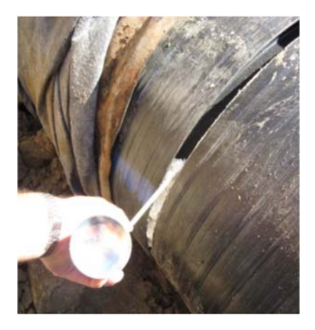
Method 1: Using Polyurethane spray foam, spray foam in joint around entire circumference of the pipe. Wipe off excess foam if necessary.

There are two methods to prevent flowable cellular grout from potentially penetrating the threaded joint. One method is the use of polyurethane spray foam just prior to completing the threading process and the other by the use of Wehoseal as supplied by Infra Pipe Solutions around the completed threaded joint.