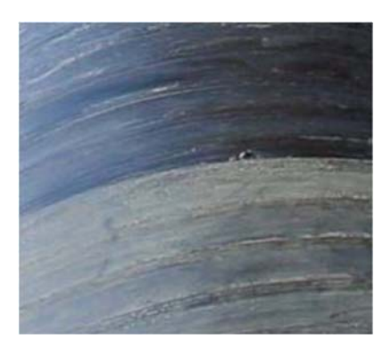
Step 4: Visually inspect the joint to ensure that male and female threads are engaged.