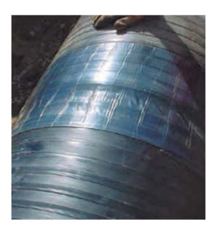
Method 2: Wehoseal joint wrap may be used to seal threaded connection. Installation is performed in the field using apropane torch and a hand roller.