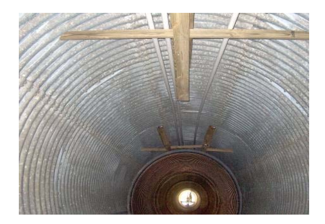
Wooden blocking that spans obvert of the pipe.

The blocking must be structurally able to resist the buoyancy force. The buoyancy force is equal to the weight of the grout that is displaced by the liner. Higher density grouts generate higher buoyancy forces.