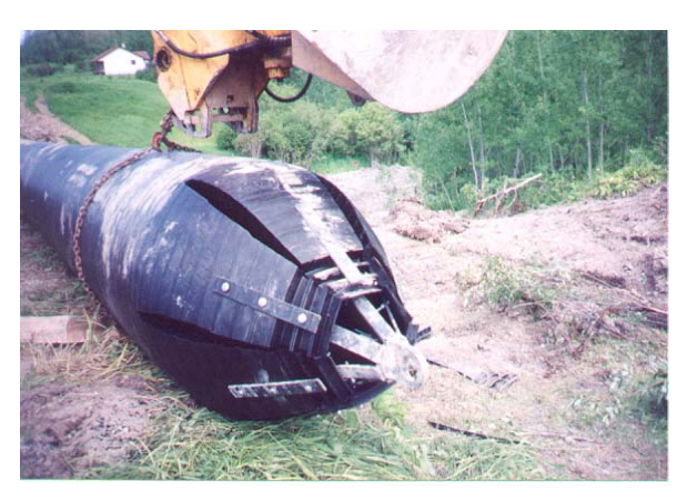
Puling heads designed by contractor.